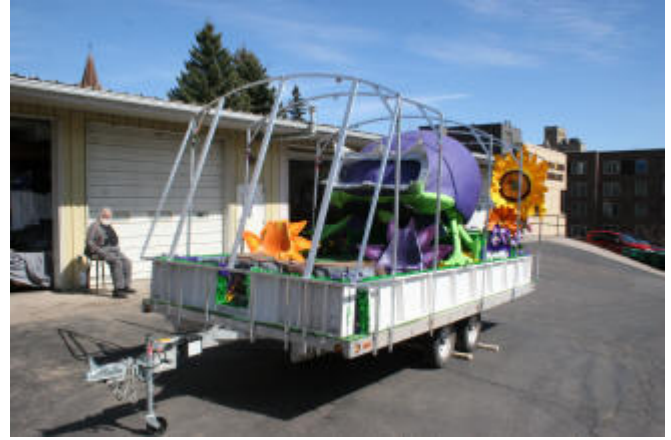
Transport/storage hoops installed