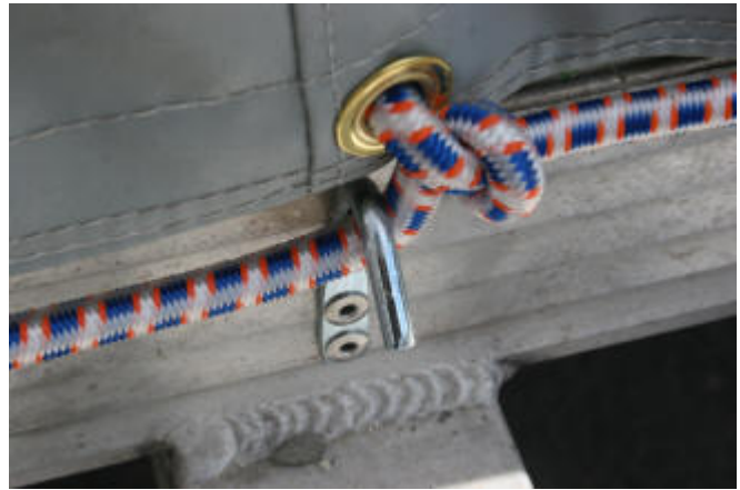
Bungee tied down.