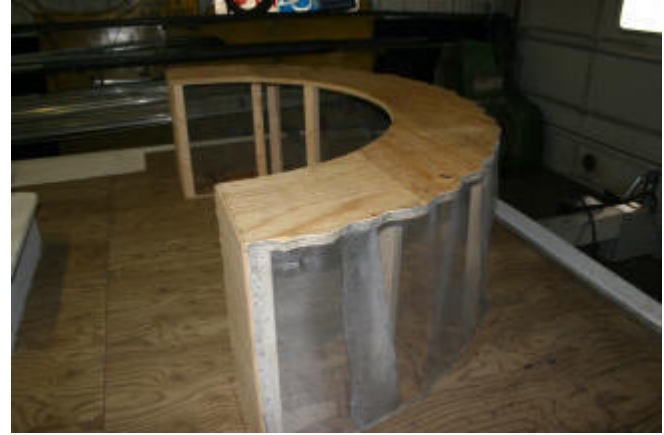
Platforms primed, chairs positioned, wall seats constructed.