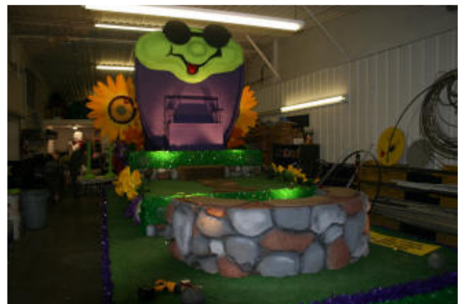
Signage applied and ready for roll out.