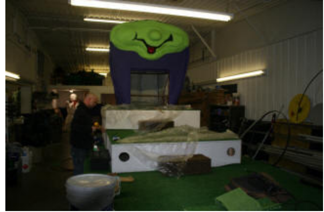
June Bug is painted