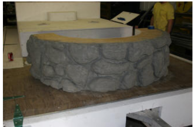
Ready for Glass