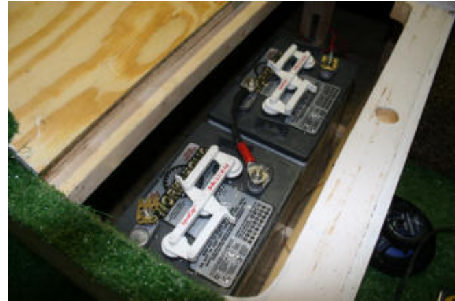
Sound System and power supplies installed.