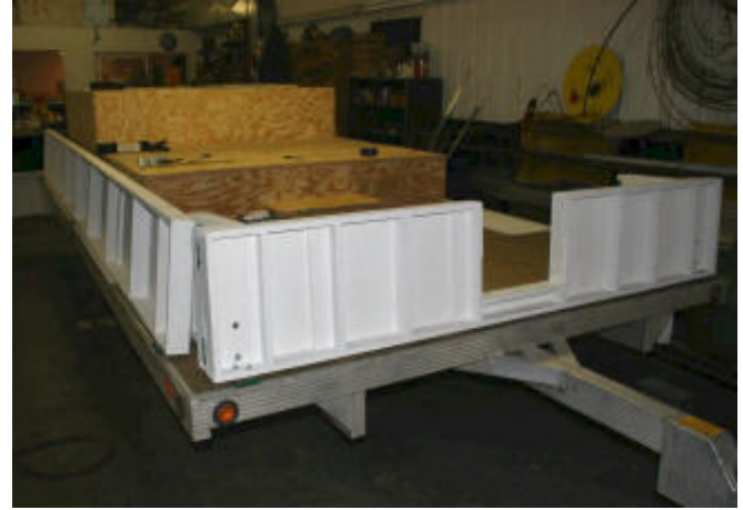
Folding Sidewalls and Platform Added.