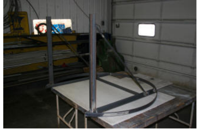
June Bug Construction & Welding.