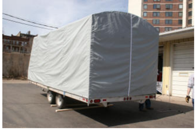
Covered for transport