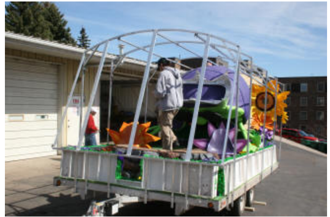
Top rails installed.