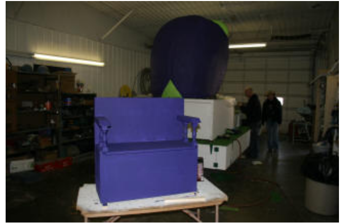
Arms & Hands Designed / Queens chair constructed