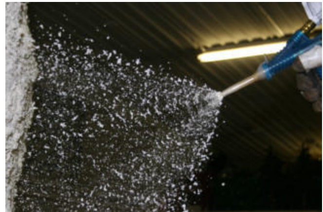
Poly urethane applied to props.