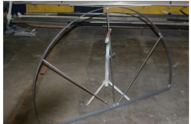
June Bug Construction