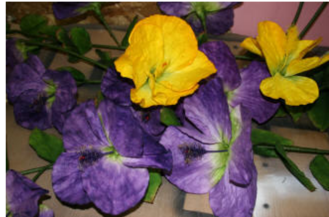
June Bug arms constructed flower props are prepped.