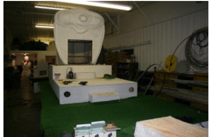
Time for carpet