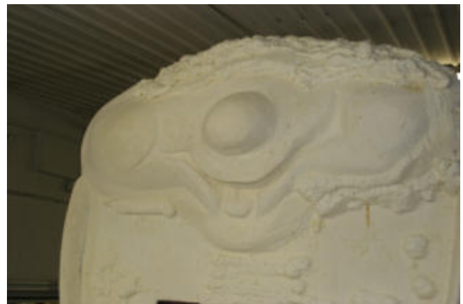
Carving Design Time