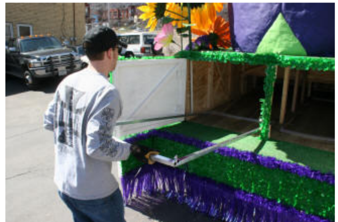
Sidewalls Rolled up transport frames brought out.