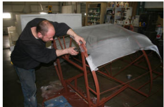
Primed and wire net applied.