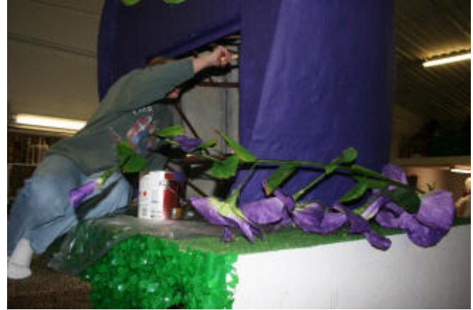
Sheeting Applied final preps are done.