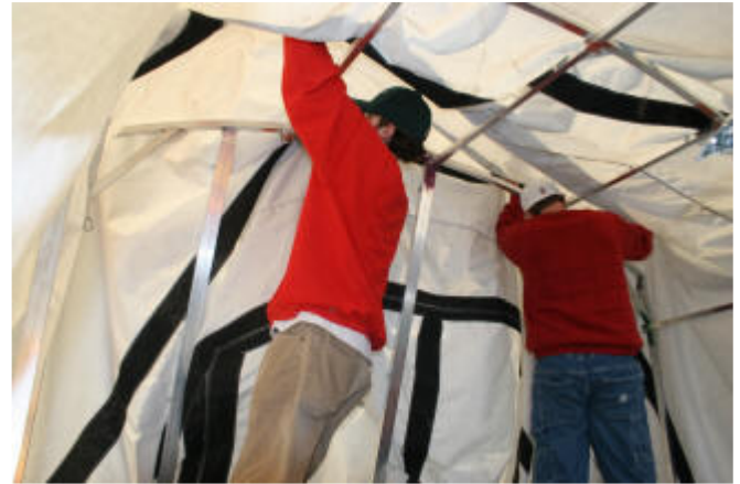
Covering put on.